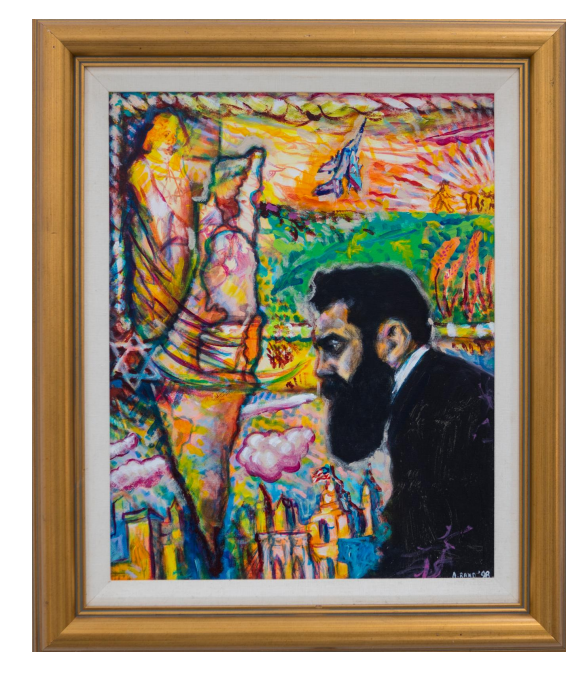
Archie Rand, Herzl, 1998.

On View September 7, 2017 - June 29, 2018