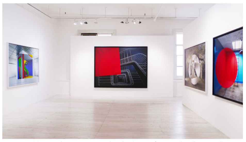
Image above: Exhibition currently on view at Sous Les Etioles Gallery

Using space as his raw material, Rousse converts abandoned locations into almost spiritual visions of color and shape, translating his intuitive, instinctual readings of space into masterful images of several "realities": that of the actual space, abandoned or soon-to-be demolished; the artist's imagined mise-en-sc è ne; and the final photograph, or the reality flattened. Here, the physical reality, like the derelict spaces in which the artist's actual marks are made, is temporary. The final— and only lasting—image is the product of the camera shutter from one and only one vantage point. The resulting optical illusion is no mere trompel'oeil, but rather an otherworldly visual—ephemeral and, above all, unforgettable.