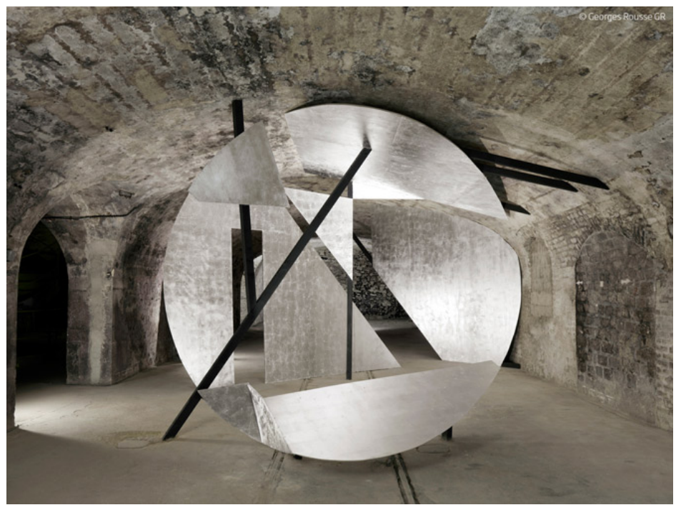
Image above: @Georges Rousse, Reims, 2012 / Courtesy of Georges Rousse and Sous Les Etoiles Gallery, New York.

Using space as his raw material, Rousse converts abandoned locations into almost spiritual visions of color and shape, translating his intuitive, instinctual readings of space into masterful images of several "realities": that of the actual space, abandoned or soon-to-be demolished; the artist's imagined mise-en-sc è ne; and the final photograph, or the reality flattened. Here, the physical reality, like the derelict spaces in which the artist's actual marks are made, is temporary. The final— and only lasting—image is the product of the camera shutter from one and only one vantage point. The resulting optical illusion is no mere trompel'oeil, but rather an otherworldly visual—ephemeral and, above all, unforgettable.