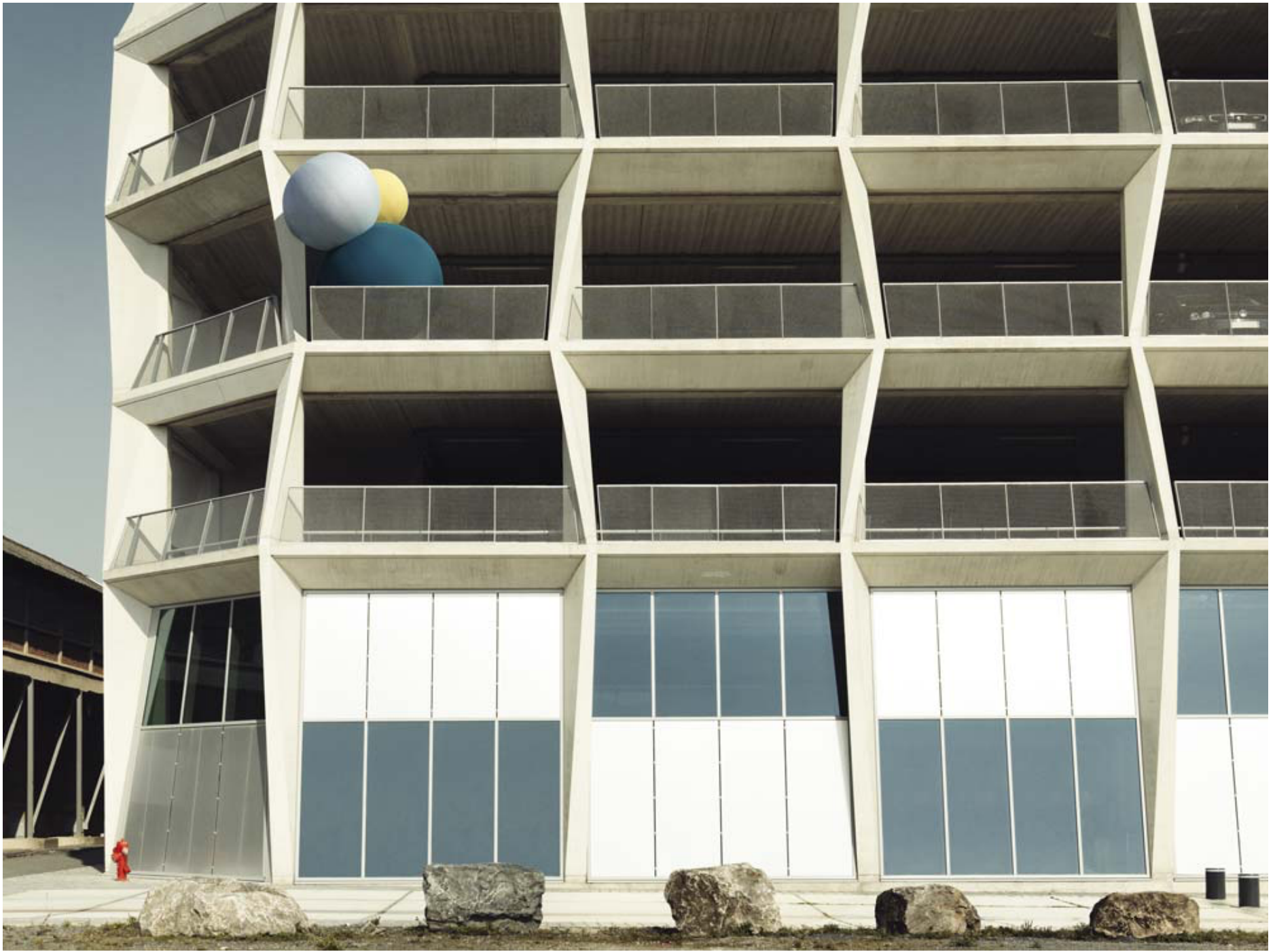
The installation measures over 4.20 m tall and is made up of 10 majestic balloons