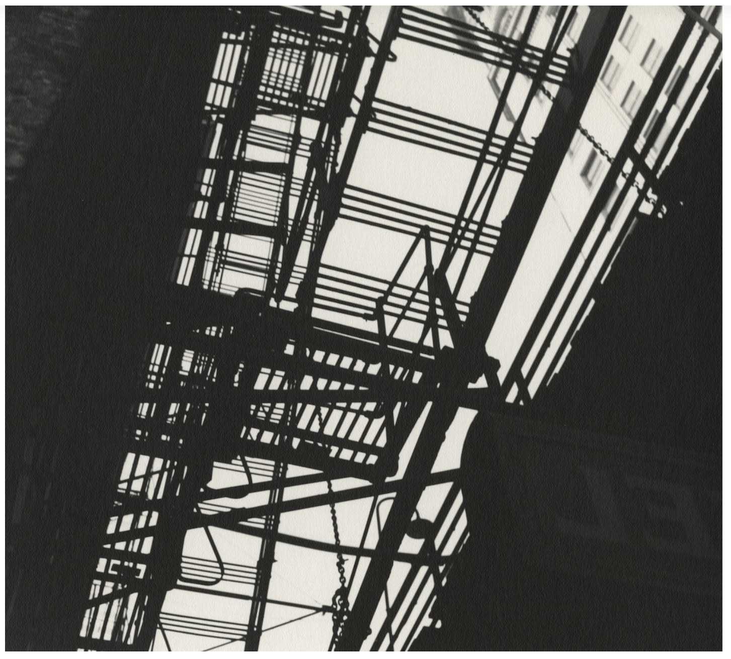
Ferenc Berko, Fire Escape, Chicago, 1947, Courtesy Tom Gitterman Gallery/ Sous Les Etoiles Gallery