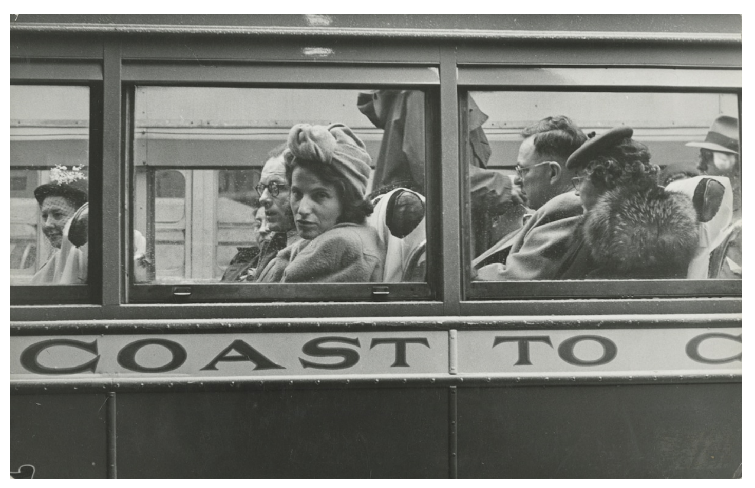
Esther Bubley, Coast to Coast, SONJ, 1947, © Estate Esther Bubley/ courtesy Howard Greenberg Gallery/ Sous Les Etoiles Gallery