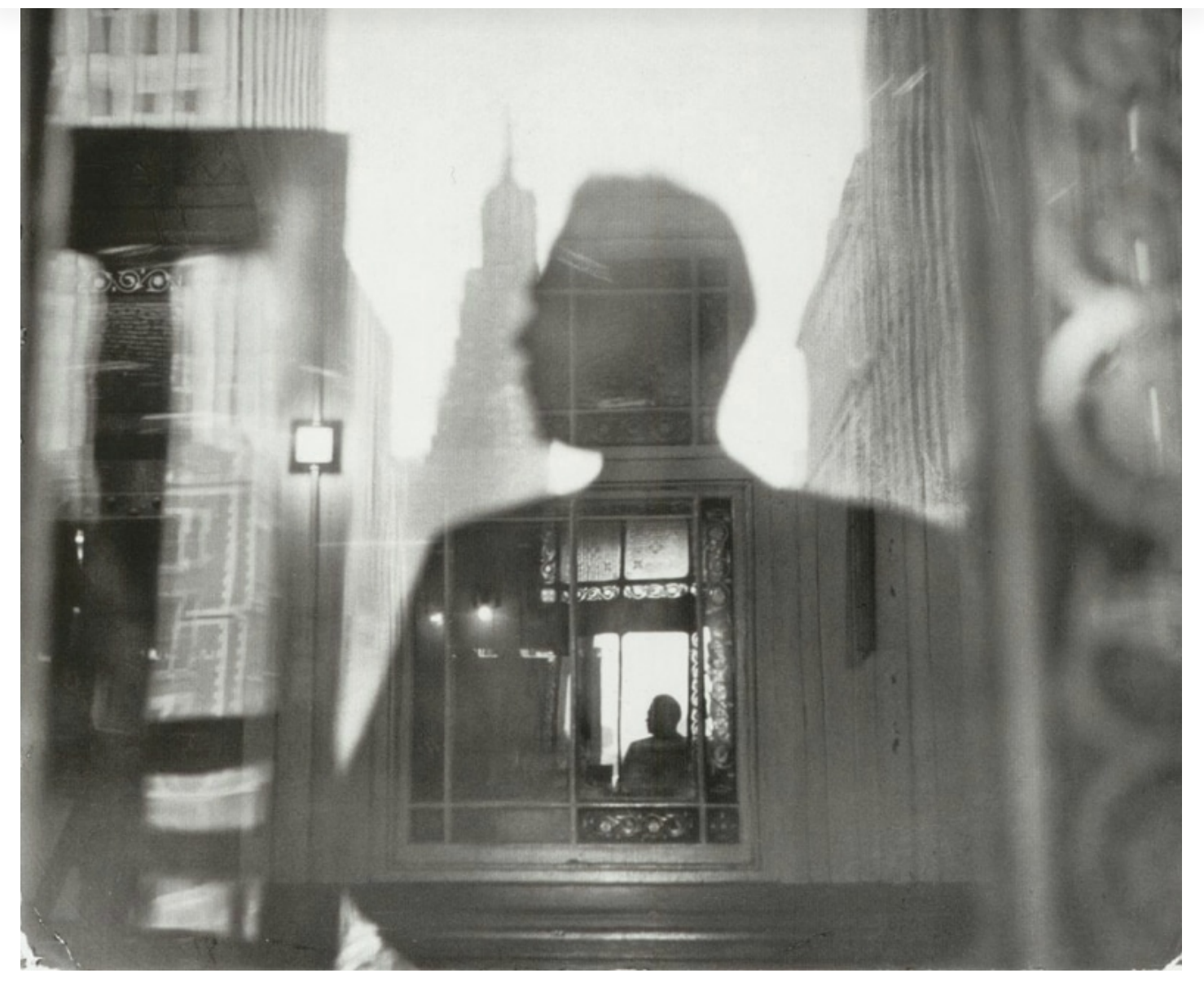
Louis Faurer, New York, NY, 1947 (profile head in El window), Courtesy Deborah Bell Gallery/ Sous Les Etoiles Gallery