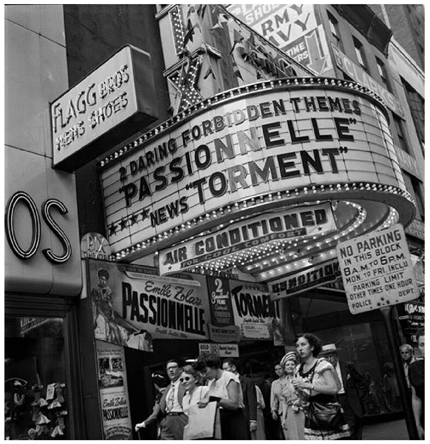
Tony Vaccaro, Pix Theater, New York, 1947, courtesy Monroe Gallery/ Sous Les Etoiles Gallery