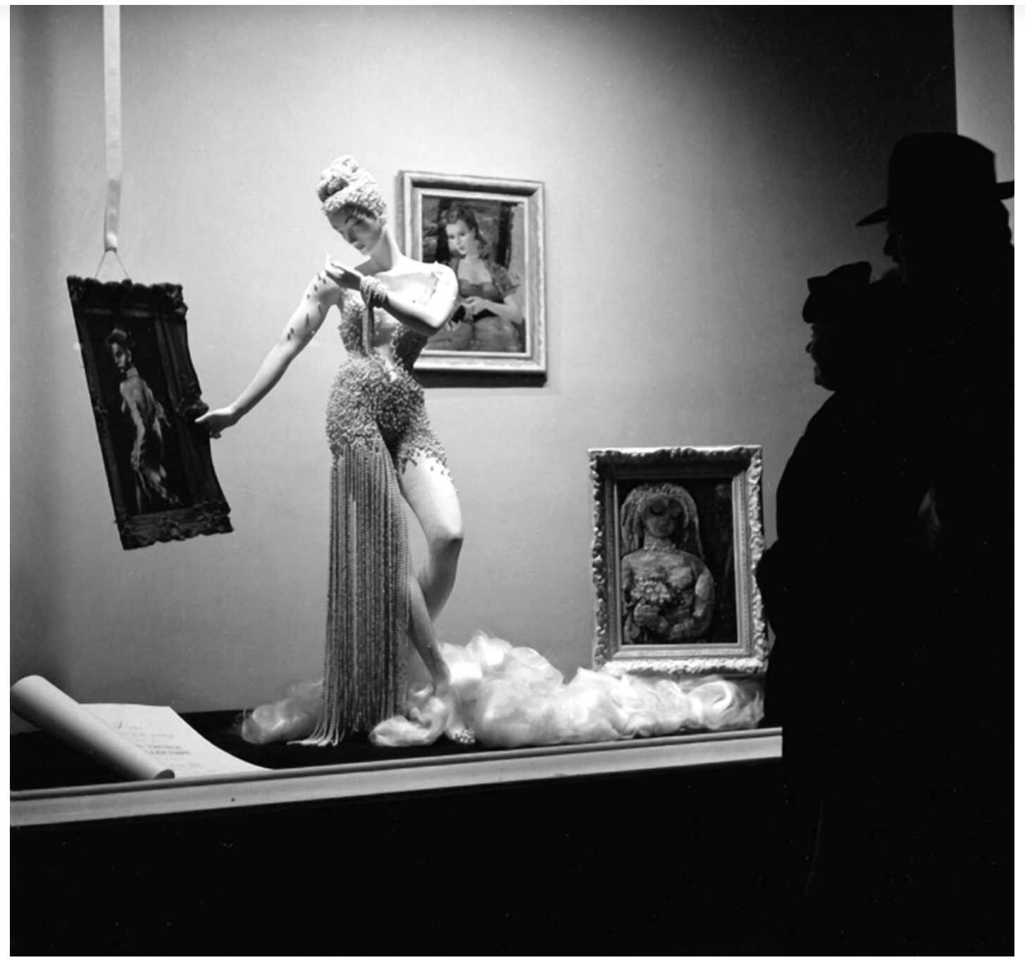
Fred Stein, Bonwit Teller Window, New York, 1947, Courtesy Rosenberg and Co Gallery/Sous Les Etoiles Gallery