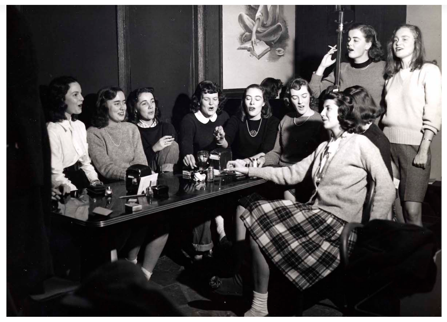
Vassar Girl, Alumnae Pub Mural , Vassar College 1947, courtesy Archives/ Collection of Vassar College and Sous Les Etoiles Gallery